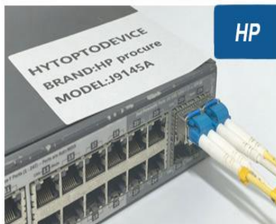
HP ProCurve 2910al-24G(J9145A)