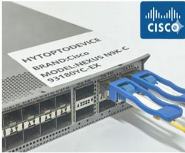
Cisco Nexus N9K-C93180YC