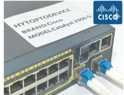
Cisco Catalyst 2960-S