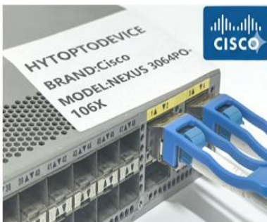
Cisco Nexus 3064PQ-106